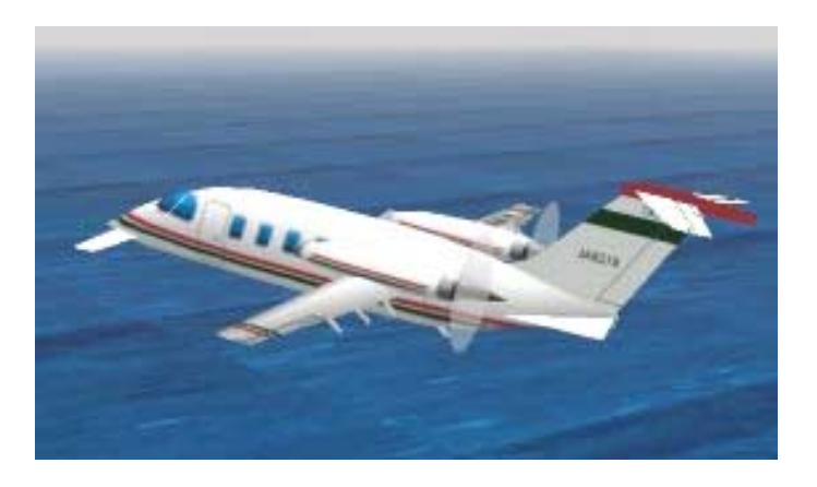
Figure 1: The Piaggio P-180 Avanti.

The main idea in all of this is to present the aerodynamics piece of the puzzle as part of a bigger picture and not as something that is isolated.